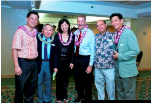
HKBAH team won another year Championship of the Chinese Organization category at the Hawaii Dragon Boat Race, Aug 23, 2008.