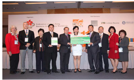
HKBAH delegates received the 1st runner-up of North America—Best Initiative Award (Hawaii US-Hong Kong Business Forum) at the H.K. Forum in Hong Kong, Dec 2, 2010.