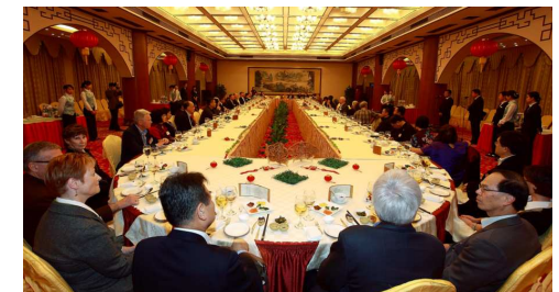
Pre H.K. Forum side trip to Guangxi: Welcome Dinner hosted by Guangxi Zhuang Autonomous Region Foreign Affairs Office, Nanning, Nov 29, 2010