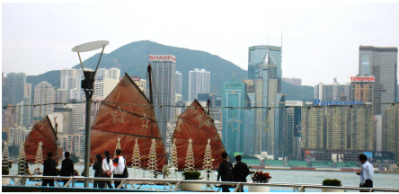
A Chinese junk sails the famous Victoria Harbour of Hong Kong.

H ong Kong Business Association of Hawaii (HKBAH), a 501 (c)(6) nonprofit, politically neutral business association, was established in 1996 by a younger generation of business professionals and entrepreneurs who immigrated to Hawaii from Hong Kong.